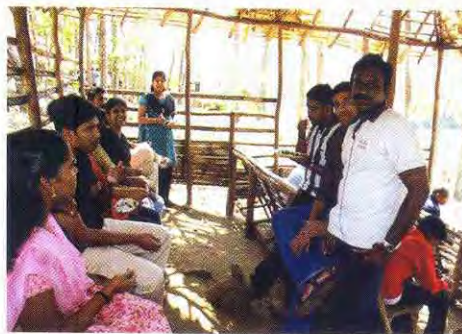
A glimpse of the staff club tour

Vidya Staff Club conducted a one day tour for Vidya Staff Members to Athirappilly, Thumburmozhi, Cherai Beach on 19 February 2011 as a part of its recreational activities. 119 members from various departments took part in the tour.