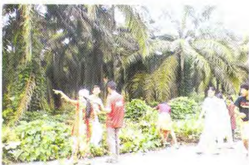
The campers at work

The annual special camping programme of the Vidya Academy of Science and Technology National Service Scheme units was held at Athirappilly Grama Panchayath, during 24-30 December 2010.