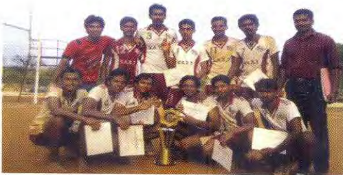
PECSAGA intercollegiate champions

Vidya Volley ball team (Men) retained PECSAGA Intercollegiate Championship held at Nehru College of Engineering & Research Centre, Pampady during 15-16 March 2011.